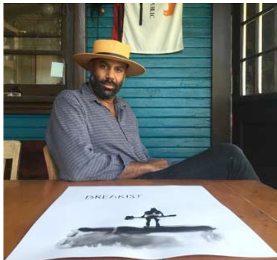
Photo of the artist